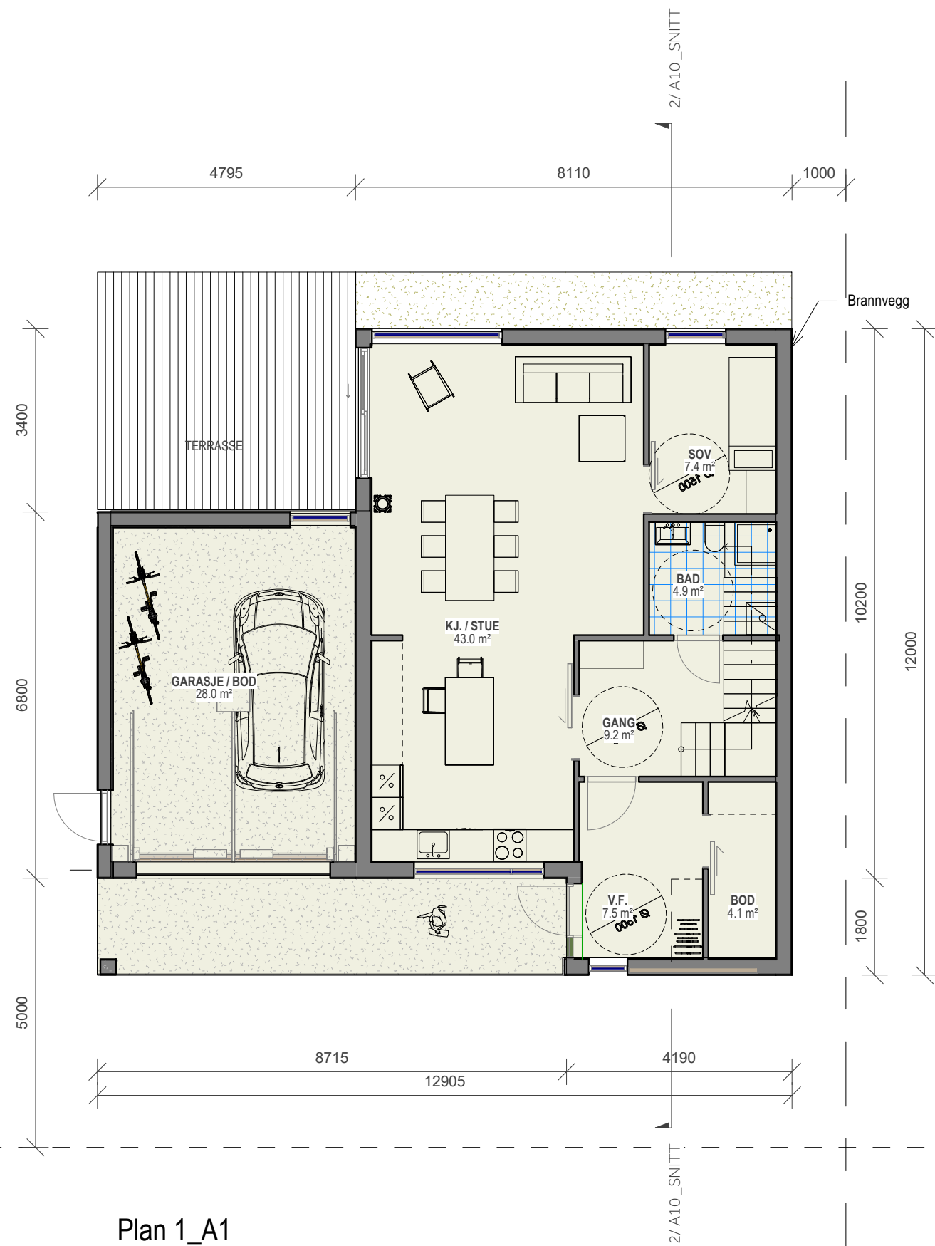
Plan 1_A1 1 : 100